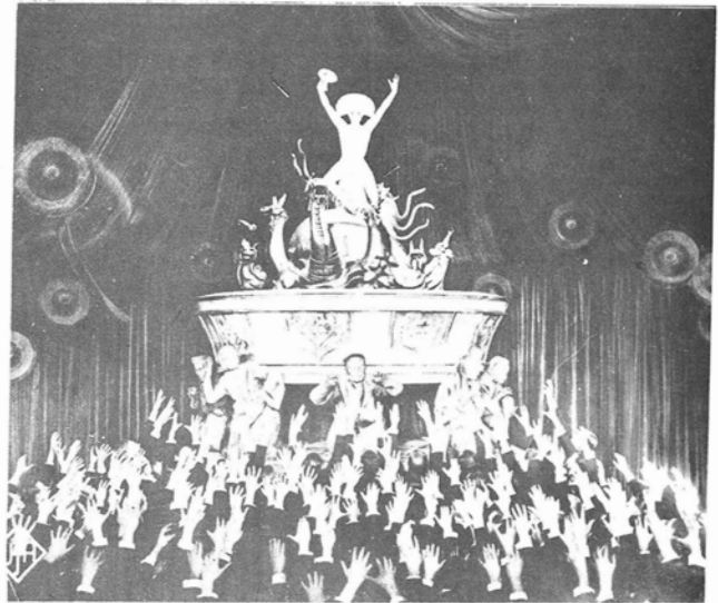
Early film directors' penchant for the spectacular is reflected in this scene from Fritz Lang's classic, "Metropolis," one of 207 films Yale has acquired in the Griggs Collection, considered one of the finest private collections in the country.