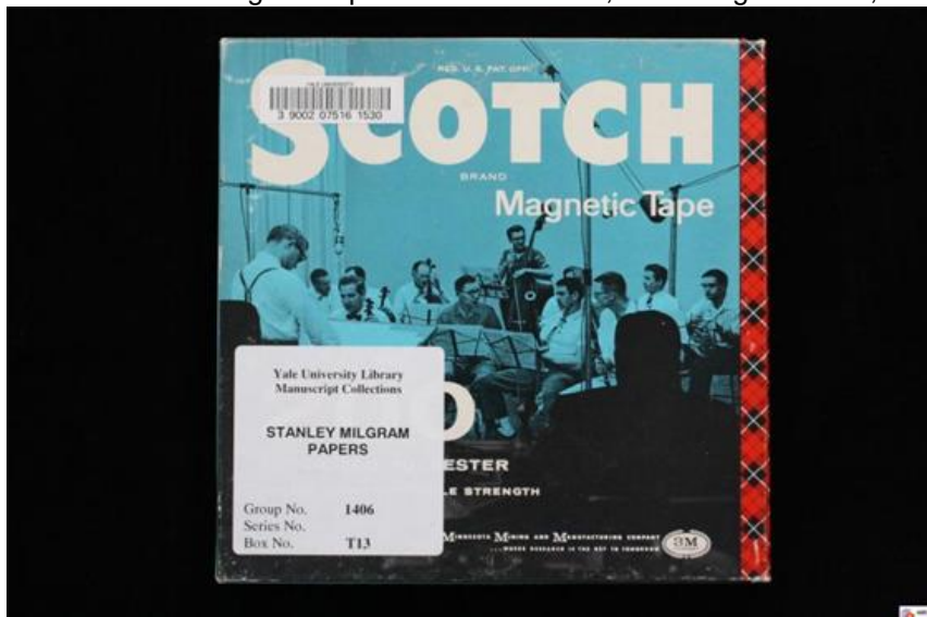
Tape of Obedience to Authority experimental sessions, Condition 3. Stanley Milgram Papers (MS 1406).