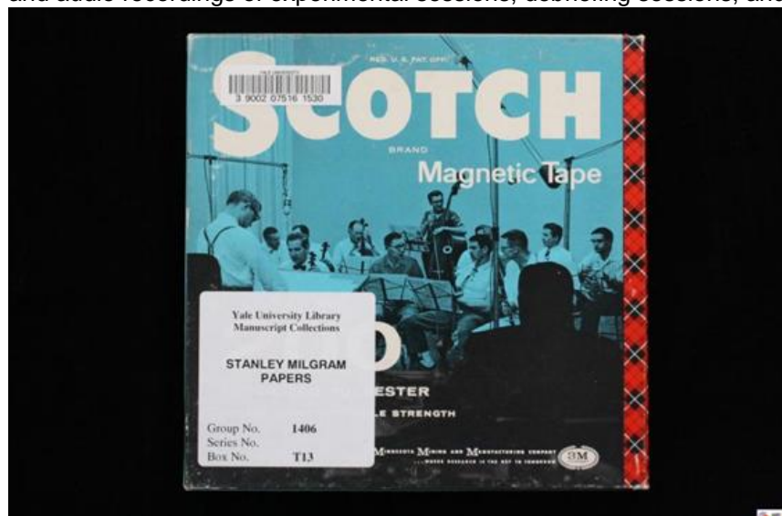
Tape of Obedience to Authority experimental sessions, Condition 3. Stanley Milgram Papers (MS 1406).